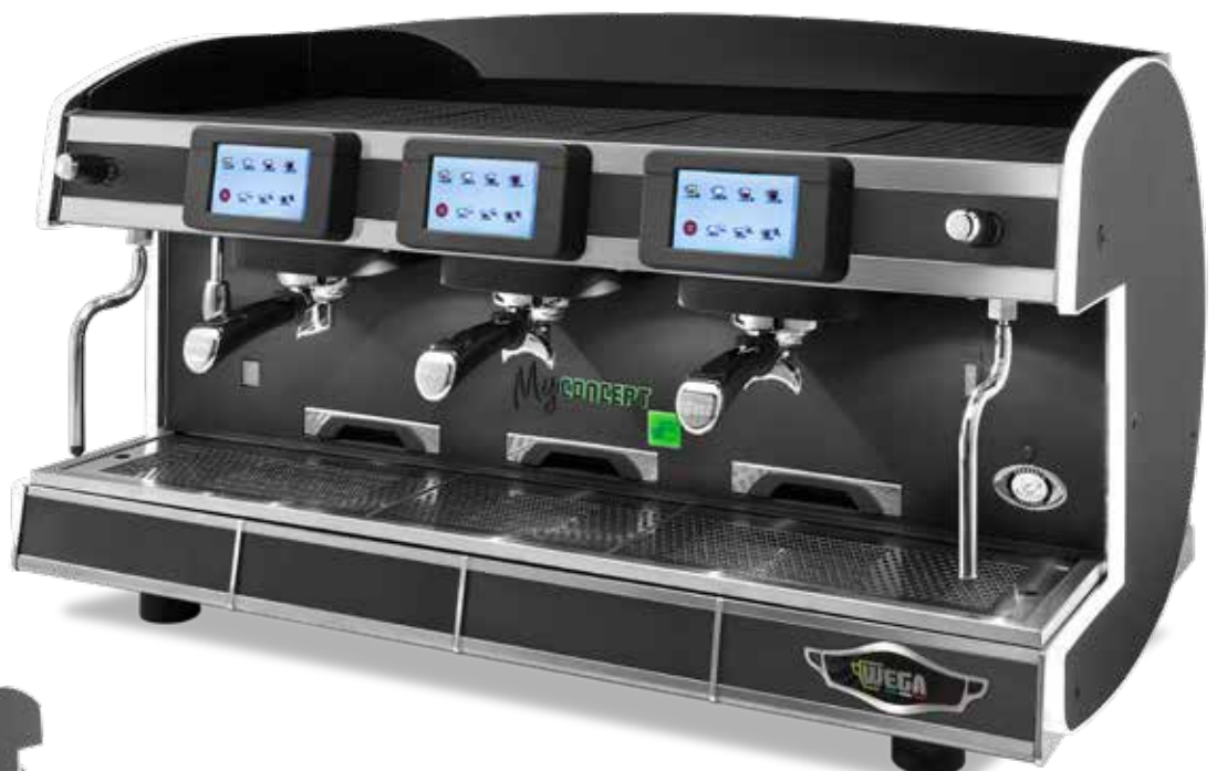
TOTAL MATT BLACK