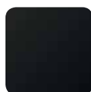
TOTAL MATT BLACK