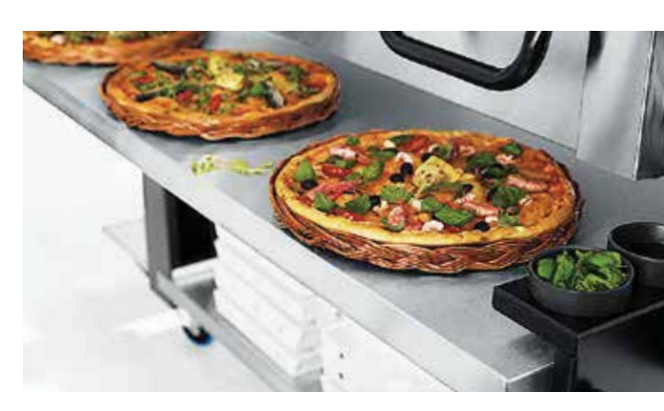
Retractable frontal unloading shelf lets you make or save space quickly and easily