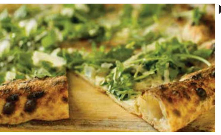
for True Artisan Pizza