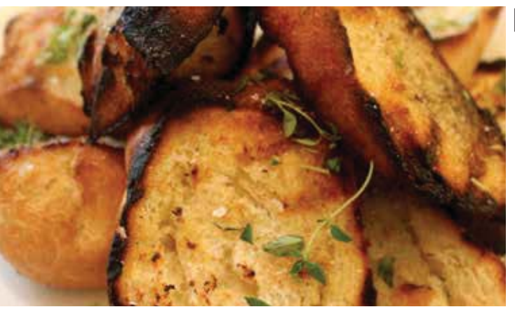
for Genuine MultiCooking