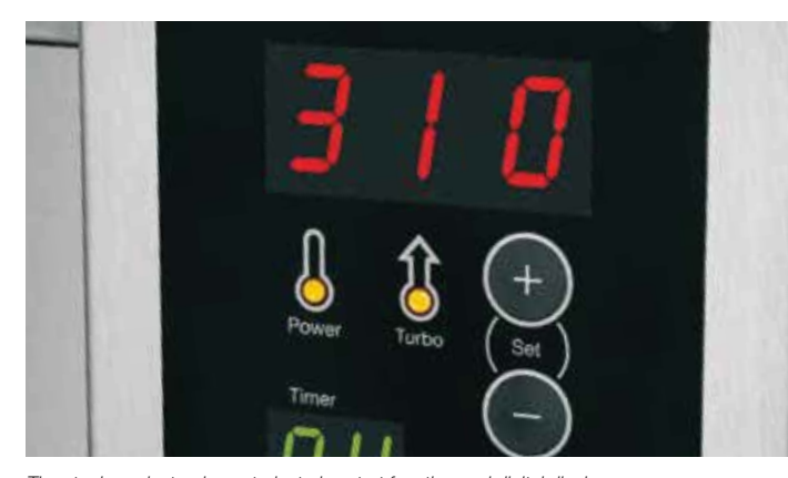
The stepless electronic controls, turbo-start function and digital display are logical and easy to use.

This beauty also has functions. It conceals a unique and effective spatial insulation concept, improves the environment, interfaces perfectly with the user and makes it very easy to clean the oven. It reflects the quality that runs right to the heart of every PizzaMaster® oven, where performance is what matters. In this respect, the oven is engineered to do exactly what we promise, enabling you to deliver professional results in every situation where convenience is essential and quality is paramount.