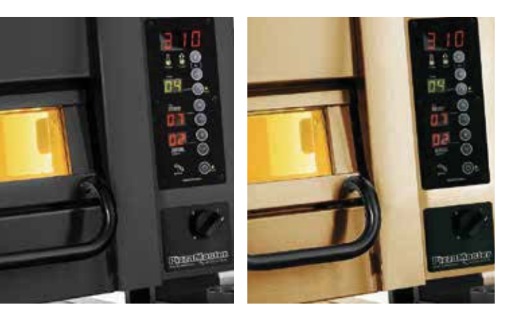
Phantom Black or Royal Gold polished stainless steel