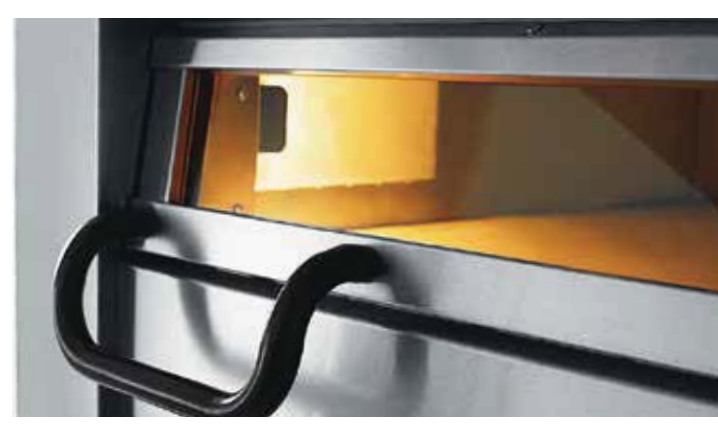
Robust, smoothly-opening door with large window and ergonomic handles