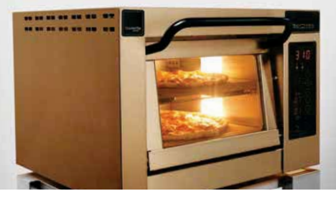
PM 351ED-1 made in Royal Gold