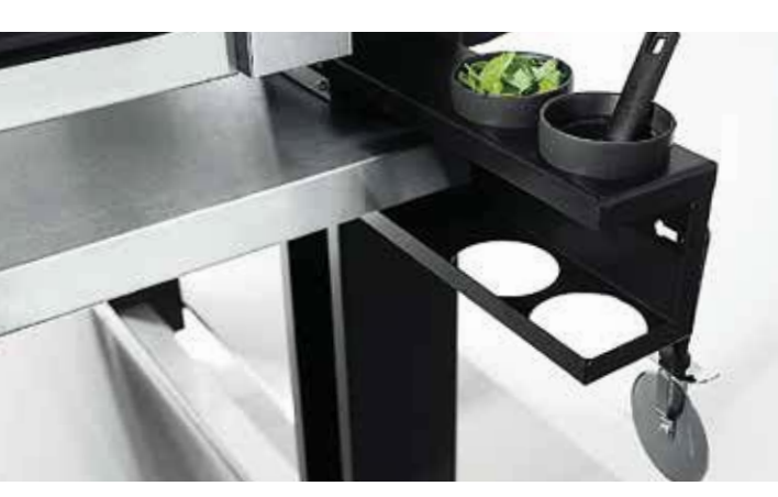
Oil - and spice rack for final touch