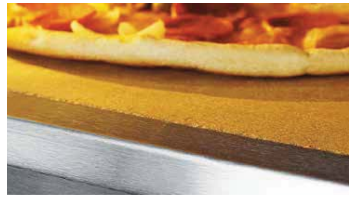
Hearth of natural material, with crisping function for perfect texture and flavour