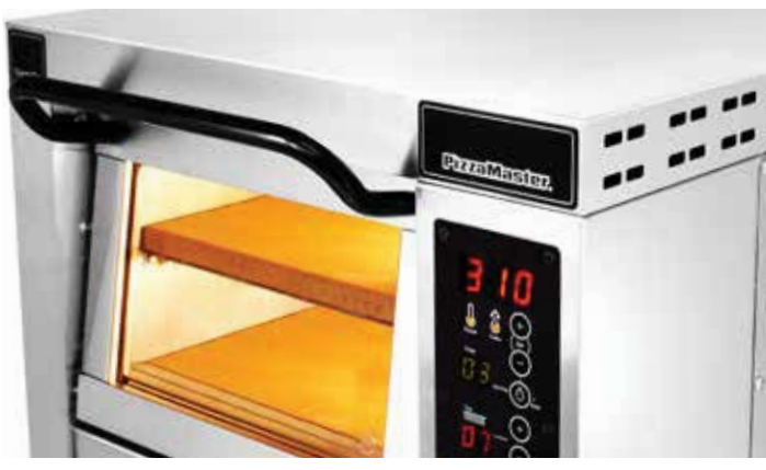
Sleek, brushed stainless-steel surfaces, virtually seamless joints and no visible screws or rivets make the oven very smart and easy to clean.