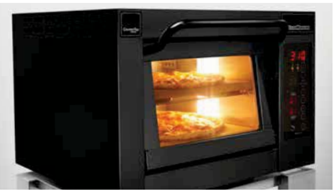
PM 351ED-1 made in Phantom Black