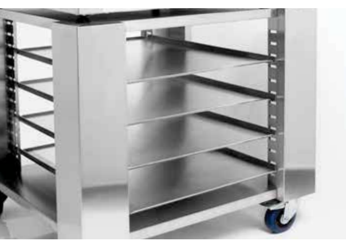
Support PM 451-S equipped with Shelf support package SP-1