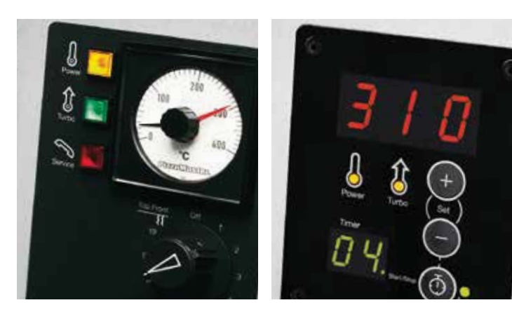
Digital or classic control panel - both logical and easy to use

PizzaMaster® ovens are delivered with legs with lockable castors as standard. They also come with an extractor hood for connection to the local extraction system, and with controls for adjusting and setting the oven ventilation. Should you wish to customize your oven further to suit your particular needs, please see the list of practical accessories or contact your nearest PizzaMaster® representative.