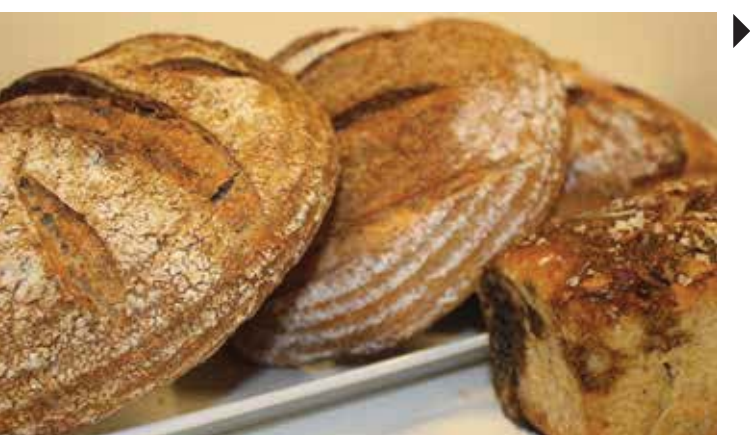
for Tastier Bread and Pastries