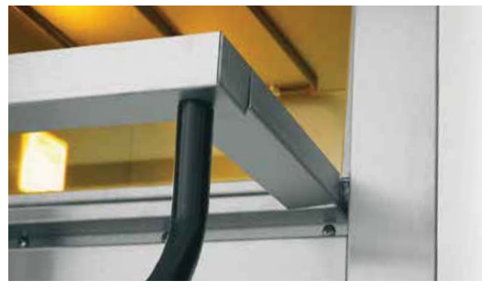
A big strong door with ergonomic handle and large window enables easy loading, inspection and unloading. Halogen lights complete the picture.