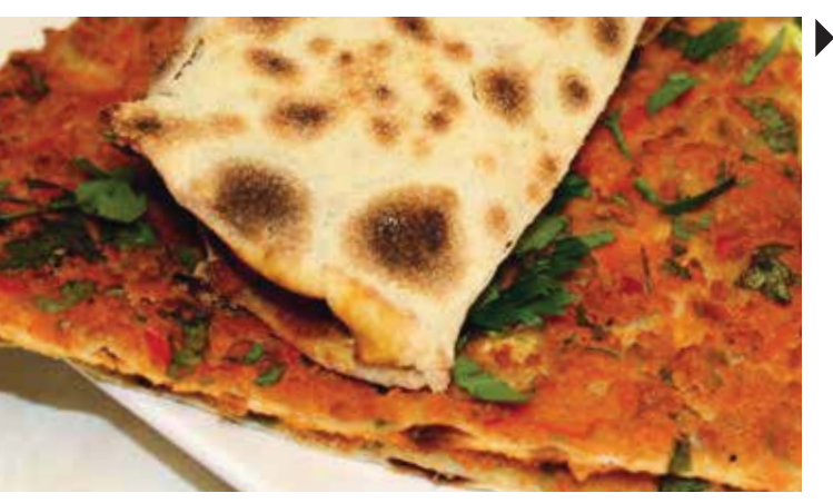
for High Temperature Baking