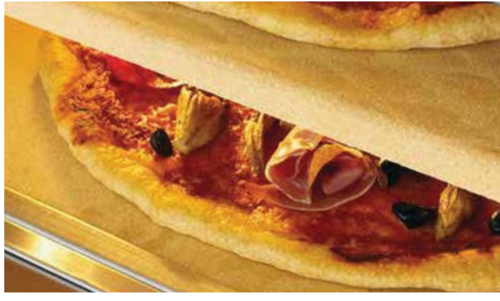
Each oven chamber can be divided easily into two decks by fitting an intermediate hearthstone and element, which doubles the oven capacity.